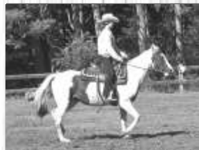
Lt. Horse Show